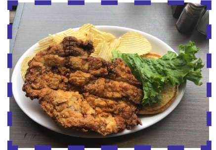
Consumers enjoy their pork at home and in restaurants.