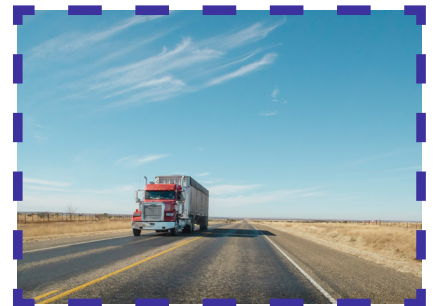
The pig is moved from the farm to a processor.