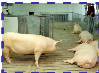
The pig is moved to a finishing barn until it weighs 280 lbs.