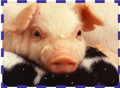
The pig is identified with ear notching or ear tags and vaccinated.

Can you figure out the correct order of a market pig's journey? There's one step missing in this pig's journey. Put the pictures in the correct order and fill in the missing step.