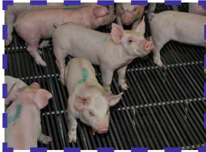
The pig is moved to a nursery around 21 days old and stays there until it weighs about 60 pounds.