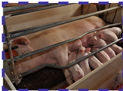
The pig is born in a "farrowing crate" to keep the sow and the piglets safe.